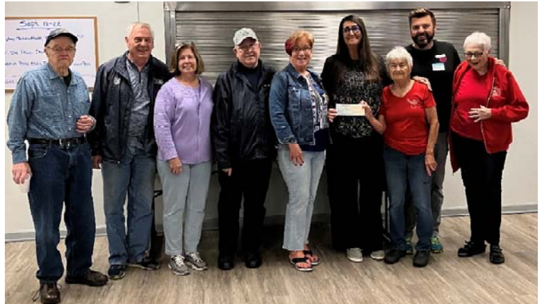
Photo: Meals on Wheels donation of $1,221 – CDA Eagles board members, MOW volunteers and coordinator